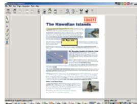
Add annotations to scanned images: notes, basic text, highlights, lines and arrows, stamps.